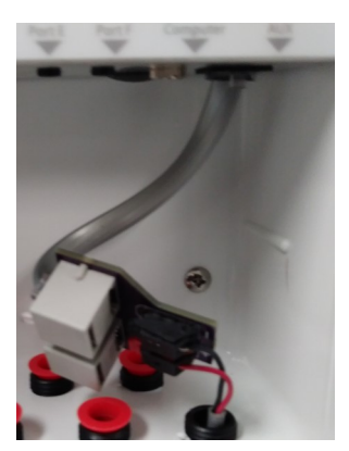
Figure 6: Adapter attached to AUX port

Note: When disconnecting the Solar Power Package from your weather station, follow the above steps in reverse order.