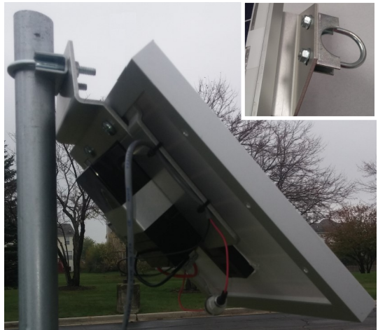
Figure 2: Solar Panel connected to post