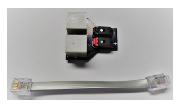
Figure 3: Terminal block connector and cable