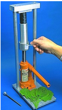
Hydraulic Plant Sap Press (item #2720)

* Calibration solutions in soil test kits include AlSO 4