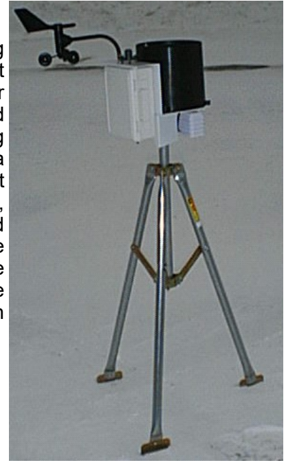
Weather Station mounted on tripod

If you are using the mounting tripod (item # 3396TP), open it and place it where the weather station is to be located. The tripod feet can also serve as mounting brackets if the unit is located on a solid surface. Slide the 3' post through both center screw clamps, adjust the height as desired and tighten the screws such that the post is perpendicular to Finally, around. attach weather station to the post with the u-bolts.