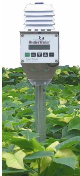
Figure 1: WeatherTracker mounted on 1" conduit

The radiation shield protects the temperature sensor from solar radiation and other sources of reflected heat. If other sensors are included, secure the sensor wires to the mast just below the display module with a plastic tie. This will make the wires less vulnerable to being accidentally severed during the season.