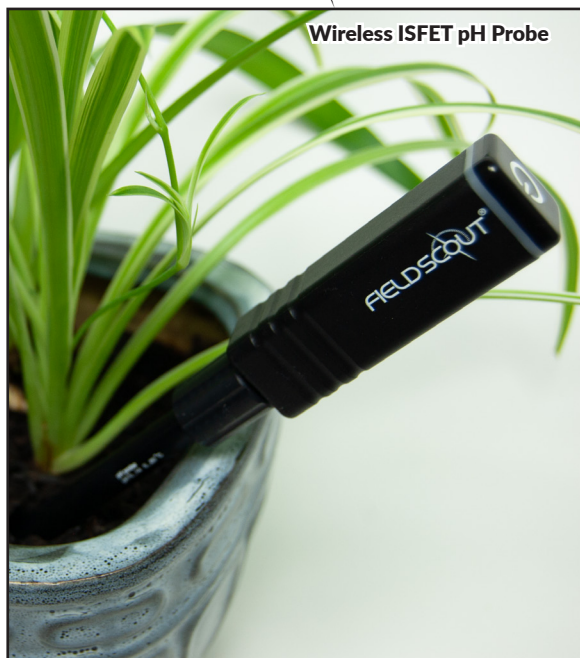
Wireless ISFET pH Probe